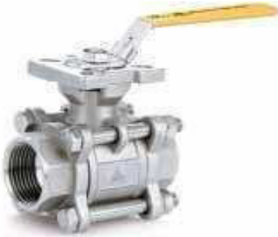
Fig no. V-158T Full Bore 1/4" ~ 4" DN 8 - DN 100